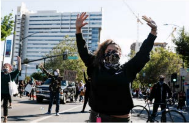
SAN JOSE — MAY 29: Protesters put their hands in the air as police walk in their direction during a protest decrying the police killing of George Floyd in downtown San Jose on Friday, May 29, 2020.

His approach — a sharp contrast to Trump's — come after a weekend full of unrest across California